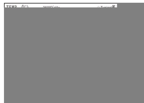
Wave Soldering (Flow Soldering)