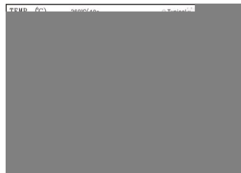
Wave Soldering (Flow Soldering)